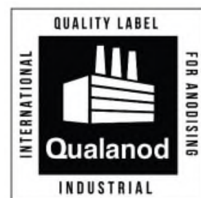
h) Example where the inner motif of a label is stamped or printed directly onto adhesive tape or stickers

PEARY LTD OPEX STREET ANNATOWN RESPUBLICIA