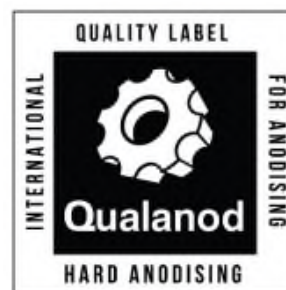
e) Example of a label in black and white