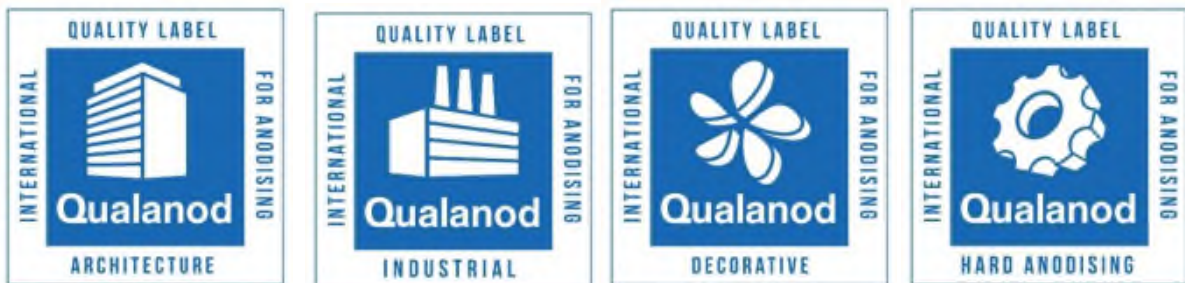
a) Label for architectural anodizing