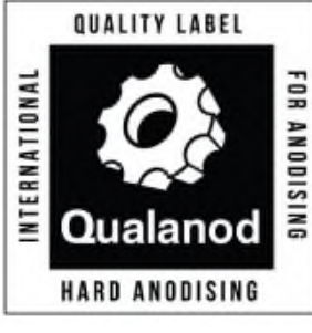
d) Label for hard anodizing

e) Example of a label in black and white